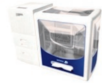
Espresso Book Machine

EVER WANTED TO PUT YOUR MEMORIES, EXPERIENCES, THOUGHTS, CREATIVITY, OR DREAMS INTO A BOOK? IF YOU'VE PICKED UP THIS PAMPHLET, YOU PROBABLY HAVE. MAYBE YOU'VE ALREADY PUBLISHED, OR JUST DREAMT OF IT. WITH THE ARRIVAL OF THE ESPRESSO BOOK MACHINE (EBM), AND THE ESPRESSNET*, AUTHORS HAVE BECOME EMPOWERED AS NEVER BEFORE. PUBLISHING